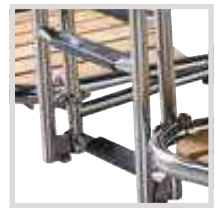
Ladder Combine with ladder. Mount with swivel fittings.