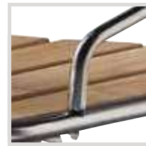
Struts upwards For better stability.

Two-piece platforms for gigs. The platform is secured by adjustable support-stanchions upwards and has flexible fastenings.