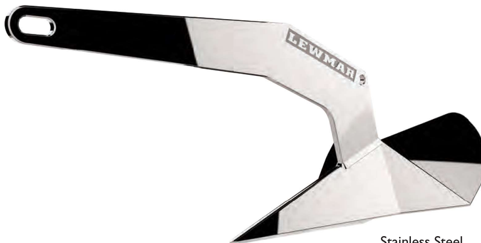
Stainless Steel DTX Anchor