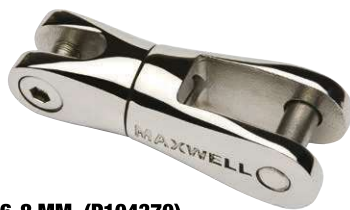
6-8 MM (P104370)