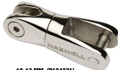
10-13 MM (P104371)