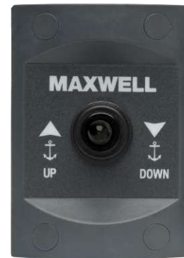
UP/DOWN REMOTE PANEL (TOGGLE TYPE) (P102938)