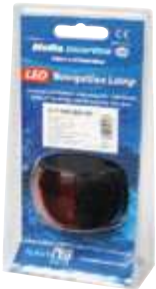
Packaging for aftermarket presentation