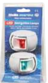
Packaging for aftermarket presentation