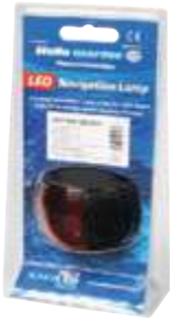
Packaging for aftermarket presentation