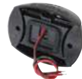
Rear of lamp clipped into shroud. Single core marine cable.