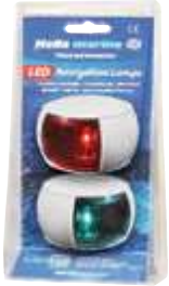
Packaging for aftermarket presentation