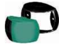
Sealed light engine clips into mounting shroud for an ultra secure attachment.

Single core (120mm) or twin core (2.5m) sheathed marine cable assemblies available. Ensures time saving, completely sealed installations.