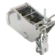
Devil's Claw Vertical