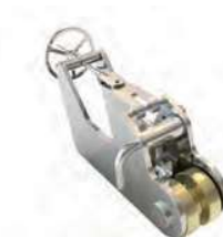
Devil's Claw Horizontal