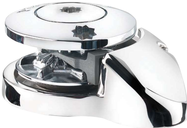
RC8 Low Profile Version