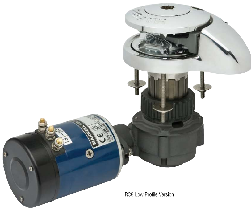
RC8 Low Profile Version