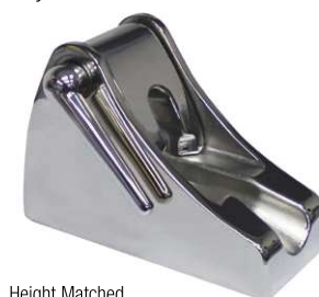
Height Matched Chain Stopper