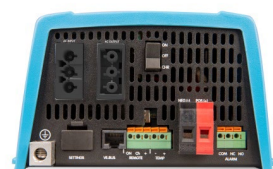
Connection area MultiPlus 500VA

Operational data can be stored and displayed on our, free of charge, VRM (Victron Remote Management) portal website. When connected to the internet, systems can be accessed remotely, and settings can be changed.