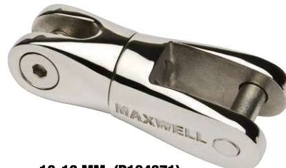
10-13 MM (P104371)