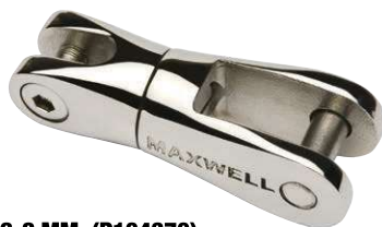
6-8 MM (P104370)