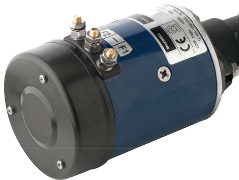
VW10 Capstan Version